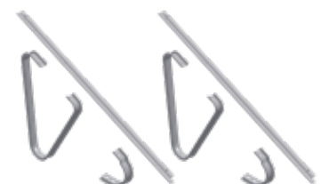
Floor mounting set (SKW/BA) for landscape format mounting only incl. backrails