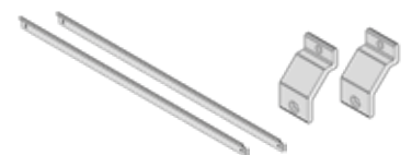
Wall mounting set (SKW/BEF) incl. Backrails