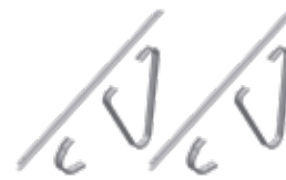
Floor mounting set (SKW/BA) for landscape format mounting only incl. backrails